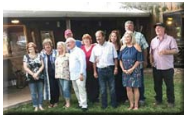
1978 Class celebrating 40-year reunion at the XXL Steakhouse