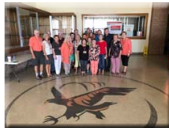
1968 Class members in PHS foyer pictured behind the mighty Hawk