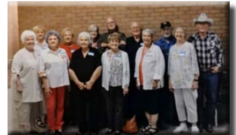
1958 Class celebrating 60-year reunion.