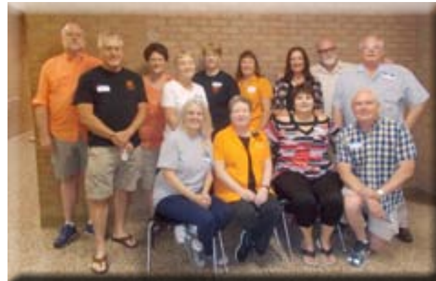
1973 Class attendees celebrating 45-year reunion at HC program